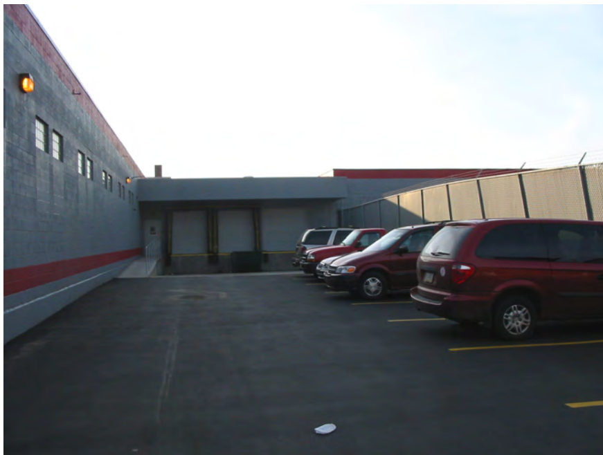
Dock and Parking Area