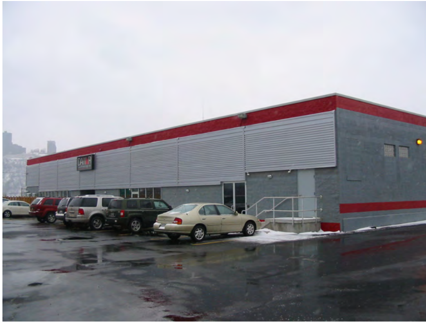
Exterior (front of building)